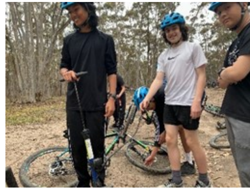
Good Samaritan Campus

Year 7 and 10 will receive the following immunisations on this day. Please note this is not a COVID-19 vaccination: