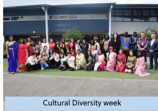
Cultural Diversity week

Almighty God and Creator, you are the Father of all people on earth. I beseech you to guide all the nations and their leaders in the ways of justice and peace. Protect us from the evils of injustice, prejudice, exploitation, conflict and war. Help us to put away mistrust, bitterness and hatred. Teach us to cease the storing and using of implements of war. Lead us to find peace, respect and freedom. Unite us in the making and sharing of tools of peace against ignorance, poverty, disease and oppression. Grant that we may grow in harmony and friendship as brothers and sisters created in your image, to your honour and praise. Amen