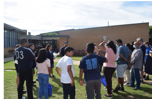
Open Day 2022

The upcoming Parent-Teacher-Student Conferences are a great opportunity for parents to work in partnership with their child's teachers in developing a shared understanding of what student progress looks like for their son or daughter. They also provide the opportunity for teachers, students and parents to set high expectations and to assist students in developing their study skills and how to develop the strategies to excel with their studies.