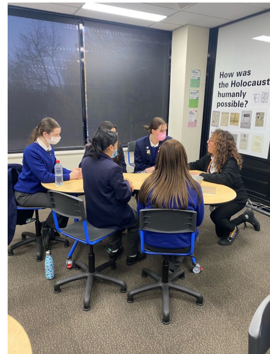
World War II Excursion to the Melbourne Holocaust Museum

Winter is well and truly here! The colder months have begun, and this brings with it a number of opportunities and challenges. We know that the flu has come back in full force and this is proving to be another health challenge we need to tackle head on. The habits we formed during the past two years will be the same habits