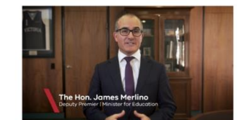
Minister Merlino VCE Transnational Conference